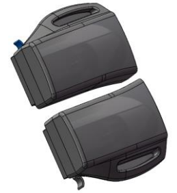
I-MOP Battery (1+1)