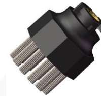
Steel Bristle Brush 3x