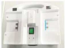
I-MOP Battery Charger 1x