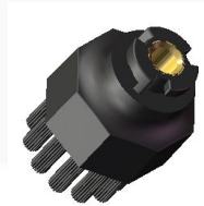
Nylon Bristle Brush 2x