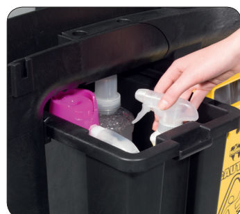
Drawer Storage Enclosed drawer storage to keep supplies tidy and out of sight.