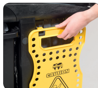
Optional Floor Sign Compact and easy to store design.