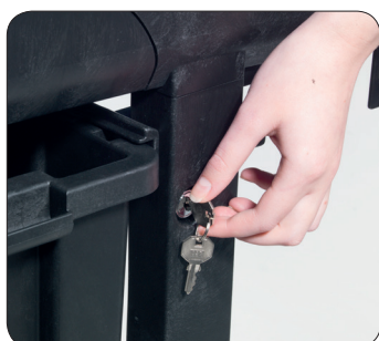
Security Options Peace of mind in public areas with optional security features.