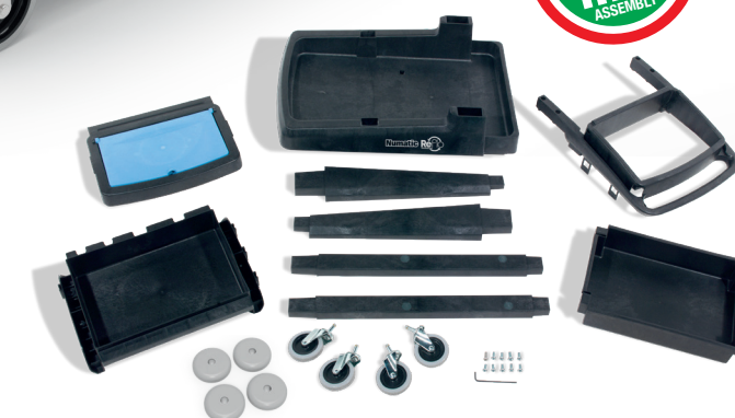
Quick and Easy Assembly Get straight to business; each model can be quickly and easily assembled in less than 15 minutes.