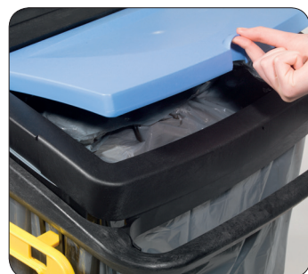
On-board Waste Facility Convenient, fully-lidded 120L waste facility; right there when you need it.