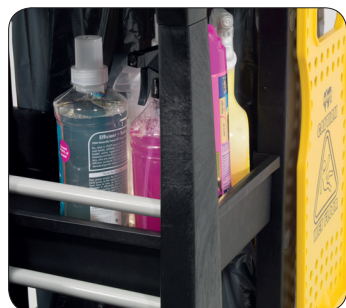
Shelf Storage Open shelf storage for easy-access to all your cleaning equipment and supplies on the move.