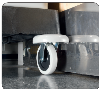
Buffer Kit Non-marking rotating buffers for extra wall and door protection.