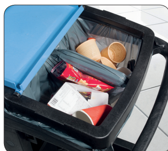
Twin Waste Option Choose between 120L or 2 x 70L waste options.